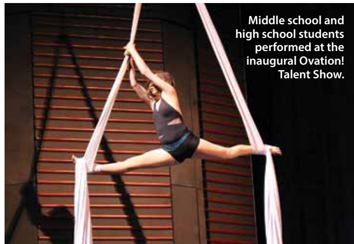
Middle school and high school students performed at the inaugural Ovation! Talent Show.