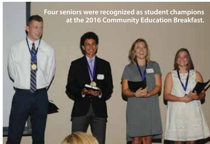
Four seniors were recognized as student champions at the 2016 Community Education Breakfast.