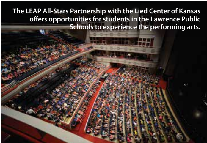
The LEAP All-Stars Partnership with the Lied Center of Kansas offers opportunities for students in the Lawrence Public Schools to experience the performing arts.