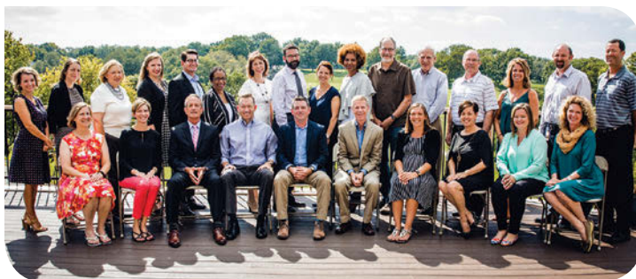
2017-2018 LAWRENCE SCHOOLS FOUNDATION BOARD